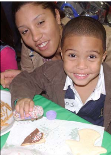
Wings reunites families and builds healthy values.