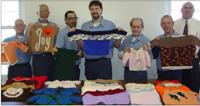
Ohio inmates—knitting partners for Guideposts "Knit for Kids"