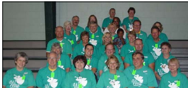
Wings volunteers in Ohio