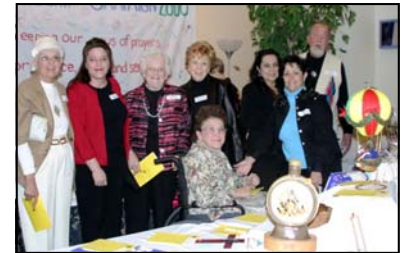
Spring for Wings 2006 Banquet and Silent Auction