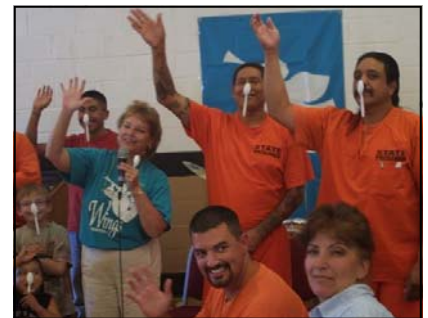
Spoon hanging champs