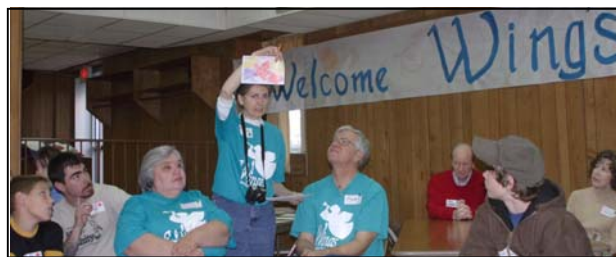
Training and discussion in Tennessee