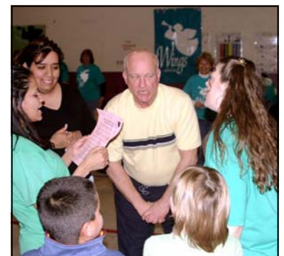
Everyone participates at Wings events