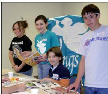
Youth at Wings for L.I.F.E.