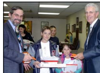
Members of the Gideons presented Bibles as gifts.