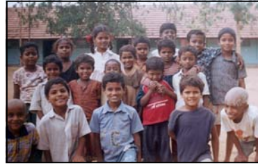
Children in India pray for the Wings visit.

Wings Ministry is a 501(c)3 organization and can accept United Way contributions from anywhere in the U.S.