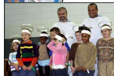
"Share Christmas program with loved ones."