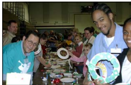
"It's a great help to our family."