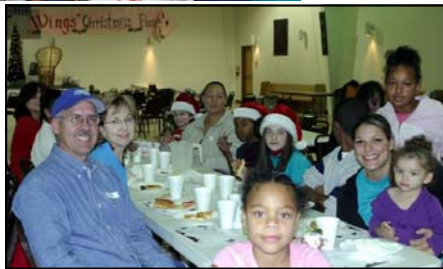
Mentors, friends & pizza go well together.