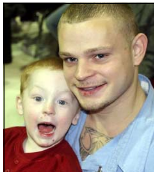
"I love my son very much."