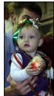
A living doll holds onto her ornament in Daddy's arms.