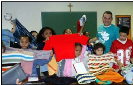
Gorgeous sweaters everywhere!