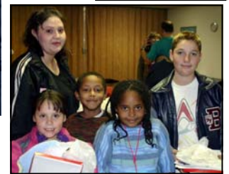
New sweaters, Bibles and fun crafts to take home.