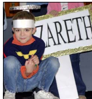
Angels wearing Christmas sweaters!

Guideposts has a goal of reaching 400,000 hand-knit sweaters by the end of 2006. We thank Wings for helping us reach our goal! Yarn of all colors, crochet hooks and plastic knitting needles of all sizes can be shipped directly to me at Guideposts Magazine for further distribution to knitters all over the world.