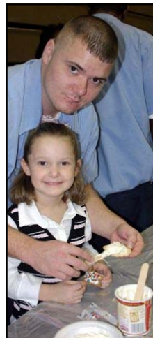
"Spending time... making cookies."