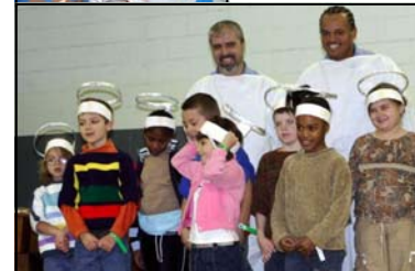
"Share Christmas program with loved ones."