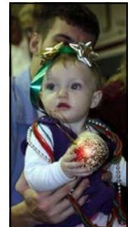
A living doll holds onto her ornament in Daddy's arms.