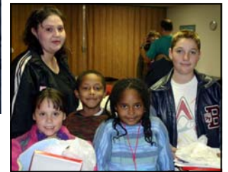
New sweaters, Bibles and fun crafts to take home.