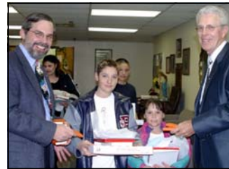
Members of the Gideons presented Bibles as gifts.