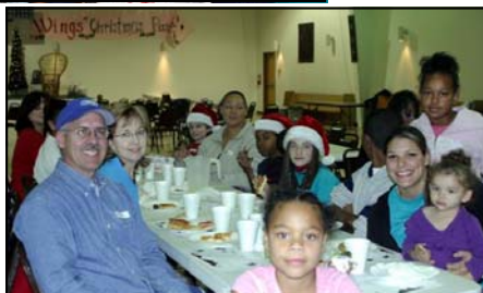
Mentors, friends & pizza go well together.