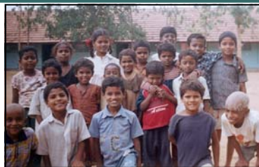
Children in India pray for the Wings visit.

Wings can accept property, jewelry, stocks, and vehicles. Wings Ministry is a 501(c)3 organization and can accept United Way contributions from anywhere in the U.S.