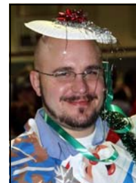
Angels come in all sizes!