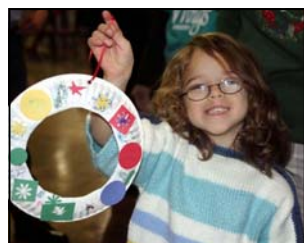
A very special wreath is proudly displayed.