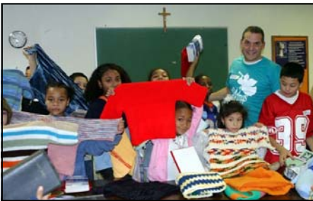
Gorgeous sweaters everywhere!