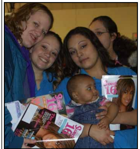
YDDC—Friends, family, & Guideposts Magazines