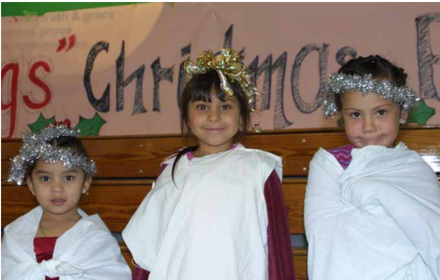
Angels at YDDC Christmas Wings Party

Wings can accept United Way contributions from anywhere in the U.S.