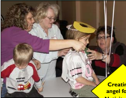
Creating an angel for the Nativity Story