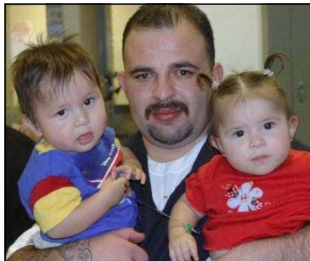
A father holds his precious babies