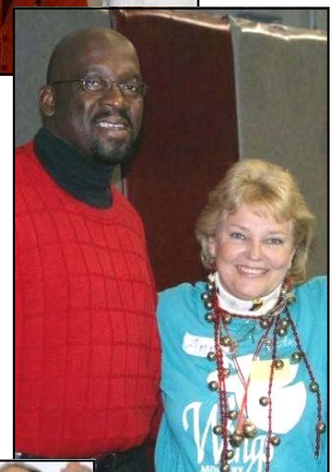
Wings volunteers in Santa Rosa, OH, and across the U.S. are the soul of the Wings Ministry.