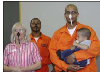
Spoon hanging fun in Las Cruces