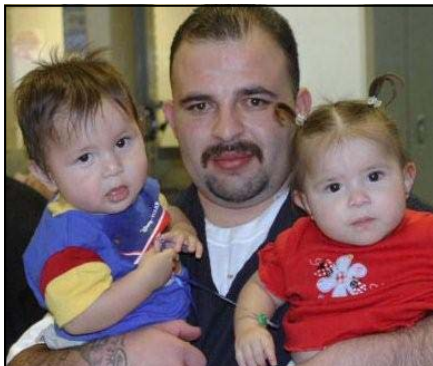
A father holds his precious babies