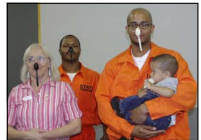
Spoon hanging fun in Las Cruces