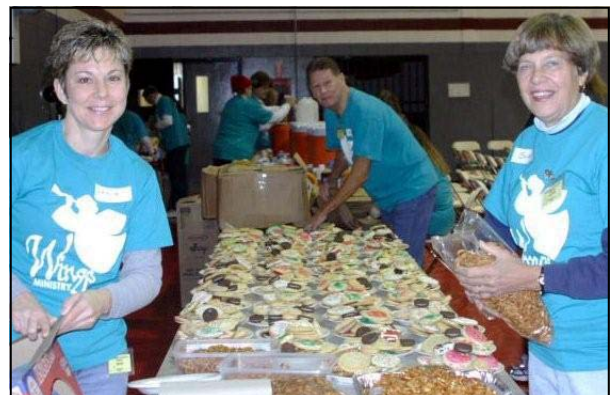
Some of the 100 dozen cookies in OH