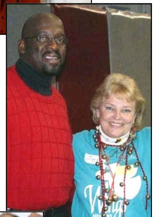
Wings volunteers in Santa Rosa, OH, and across the U.S. are the soul of the Wings Ministry.