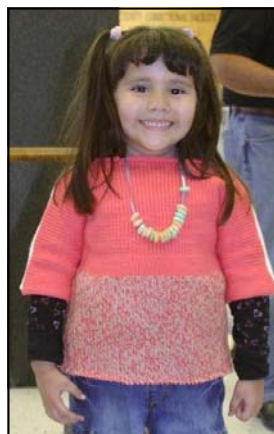
A Cherrio necklace, a new sweater, and a smile