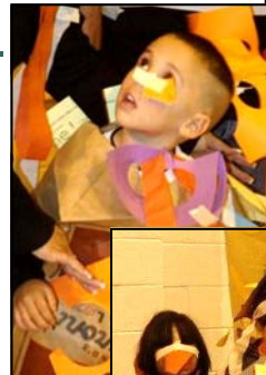
One little turkey amid many turkeys at Wings for L.I.F.E., Albuquerque