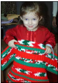
Angel wings and sweaters are fun