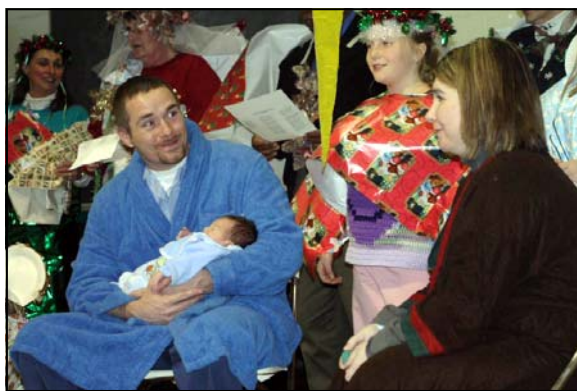
Living Nativity story brings a family together