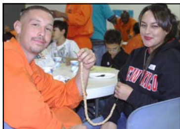
Crafts unite families

"...chance to be with my wife and hear the Word of the Lord...pizza was a bonus."