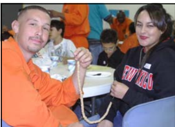
Crafts unite families

"...chance to be with my wife and hear the Word of the Lord...pizza was a bonus."