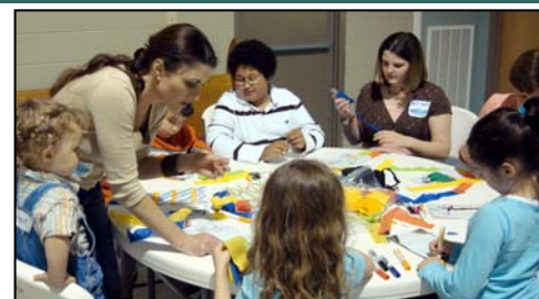
Craft time at McMinnville, TN