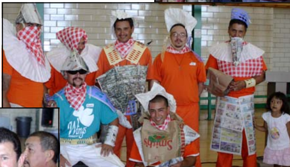
State Fair "Cowboys"