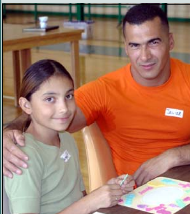
Springer Correctional Center Party reunites a father & daughter while making photo frames.

Steering Committee members will begin planning for Wings for L.I.F.E. in Tennessee. The program will meet twice monthly and provide social support for family members of prisoners and opportunities for learning about life issues. Wings Parties have been held in several TN cities and more are planned.