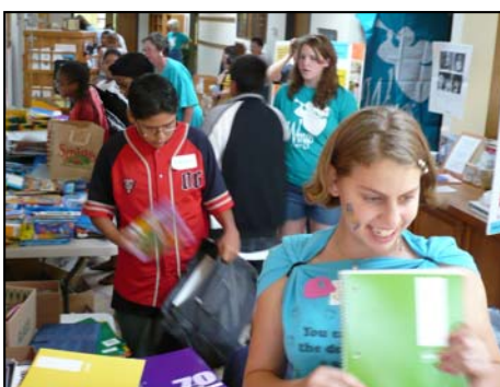
School supplies are a hit at the Wings Party.