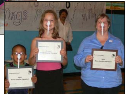
Spoon hanging champs—Back-To-School Party, Roswell, NM