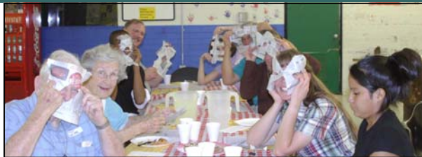
Albuquerque Wings for L.I.F.E. table activity

CONTACT: Ann Edenfield Sweet (505) 291-6412 AnnEdenfield@WingsMinistry.org