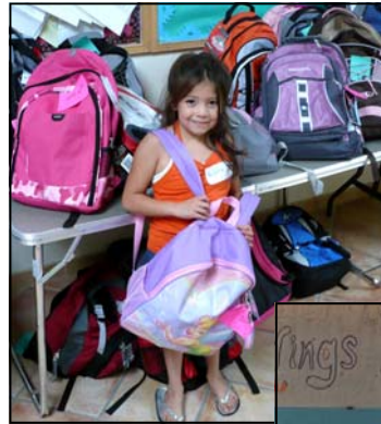
With so many backpacks donated through Family Life Radio, it was hard to decide which was the prettiest.

Thanks to all the faithful volunteers in both cities who made this possible.