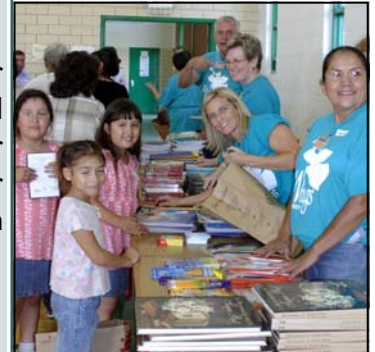
Thanks to Guideposts Magazine , Library of Hope , and all the volunteers at Springer!