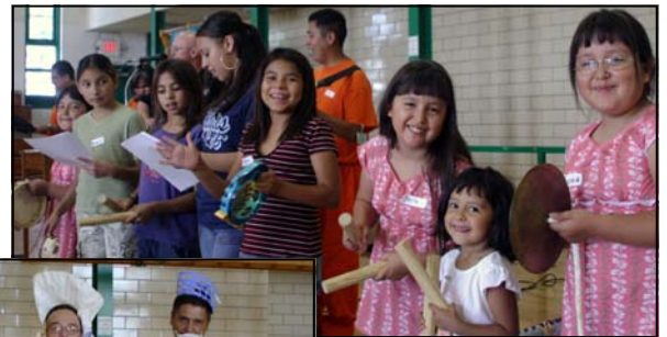
Making a joyful noise— inmates and children.