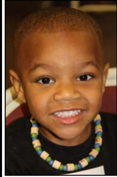
Phone # necklaces