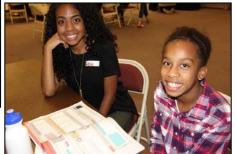
Learning about dogs & one-on-one tutoring