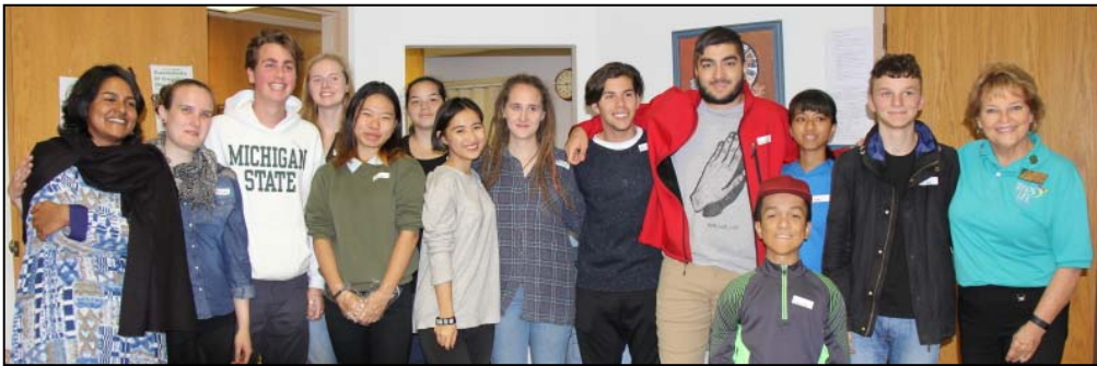
Northeast NM Correctional Facility—Clayton, NM 11-18-17