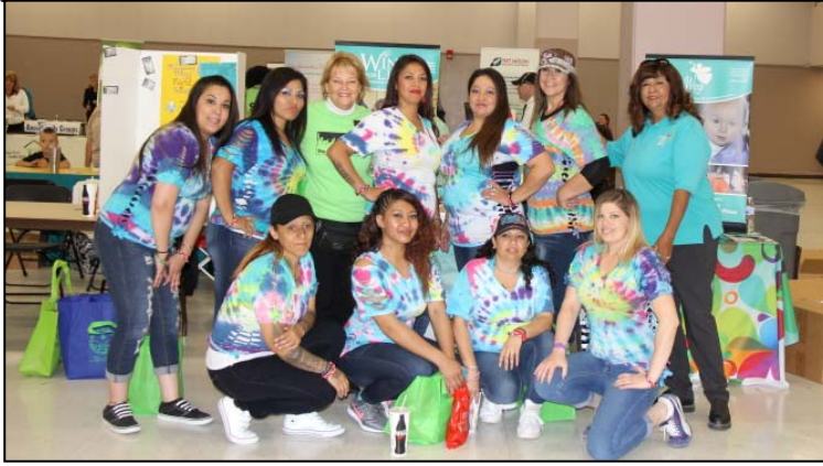
Albuquerque Celebrates Recovery—Convention Center 9-28-17