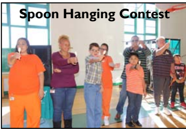
Spoon Hanging Contest