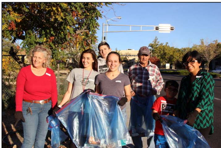
Make a Difference Day —Trash pick-up at WFL