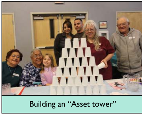
Building an “Asset tower”