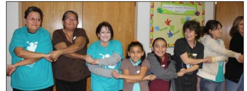
Connecting lives—strengthening relationships

True savings are law-abiding, productive, contributing members to society and each person becomes the man or woman God intended them to be.