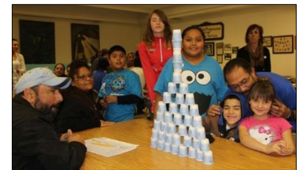
Learning to build developmental assets

Please consider making a tax deductible, year-end charitable gift to Wings, a 501(c) 3 organization, through United Way, company matching-fund contributions, on-line, or the enclosed envelope.