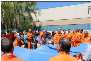
Family Day in prison