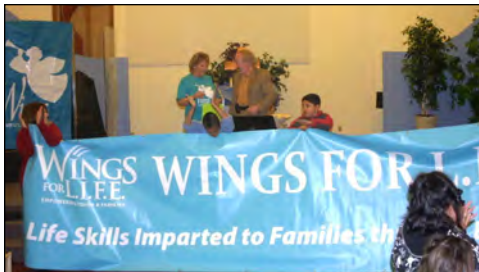
New banner — Gift from Joy Junction!