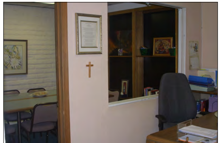
Reception area looking into the conference room.