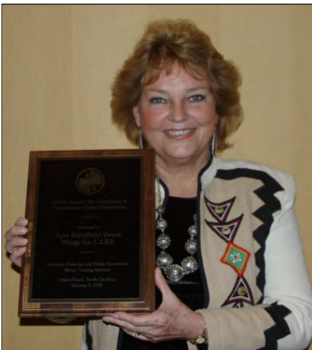
APPA National Award of Excellence

THANKS to everyone for your love and support and for helping me follow my calling. I can't wait to see what this new year and decade will bring to Wings!