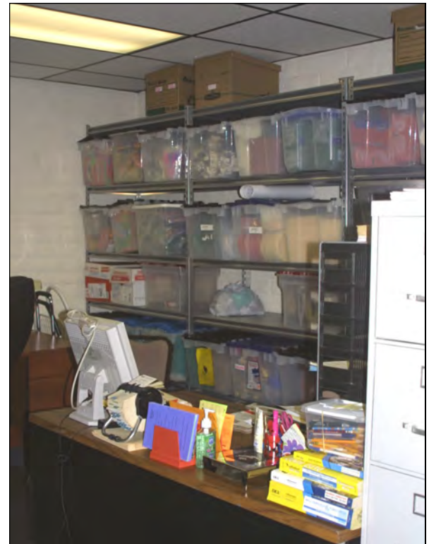
Wall of shelves for tubs of party supplies.