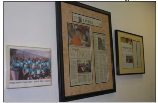
Front entry hall

THANKS to the Albuquerque Rape Crisis Center for the furniture!